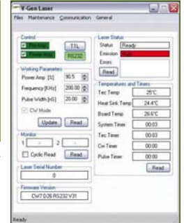
PC user application