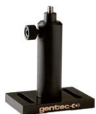
Stand with Delrin Post (Model Number: 200428)