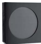
QE95ELP-S-MB (Long Pulse-Convection)