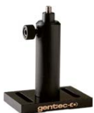
Stand with Delrin Post (Model Number: 200428)