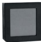
QE65ELP-S-MB (XLong Pulse-Convection)