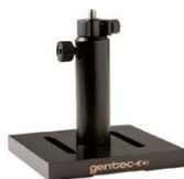
Stand with Delrin Post (201284, For -H Model)