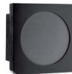
QE95ELP-H-MB (Long Pulse-Heatsink)