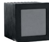
QE65ELP-H-MB (XLong Pulse-Heatsink)