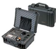
Pelican Carrying Case