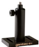
Stand with Delrin Post (Model Number: 200428)