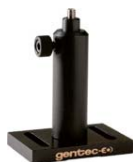
Stand with Delrin Post (200428, For -S Model)