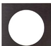
QED-95 Attenuator (Model Number: 201323)