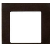
QED-65 Attenuator (Model Number: 201282)