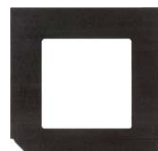
QED-50 Attenuator (Model Number: 201198)