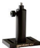
Stand with Delrin Post (Model Number: 200428)