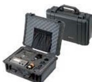
Pelican Carrying Case