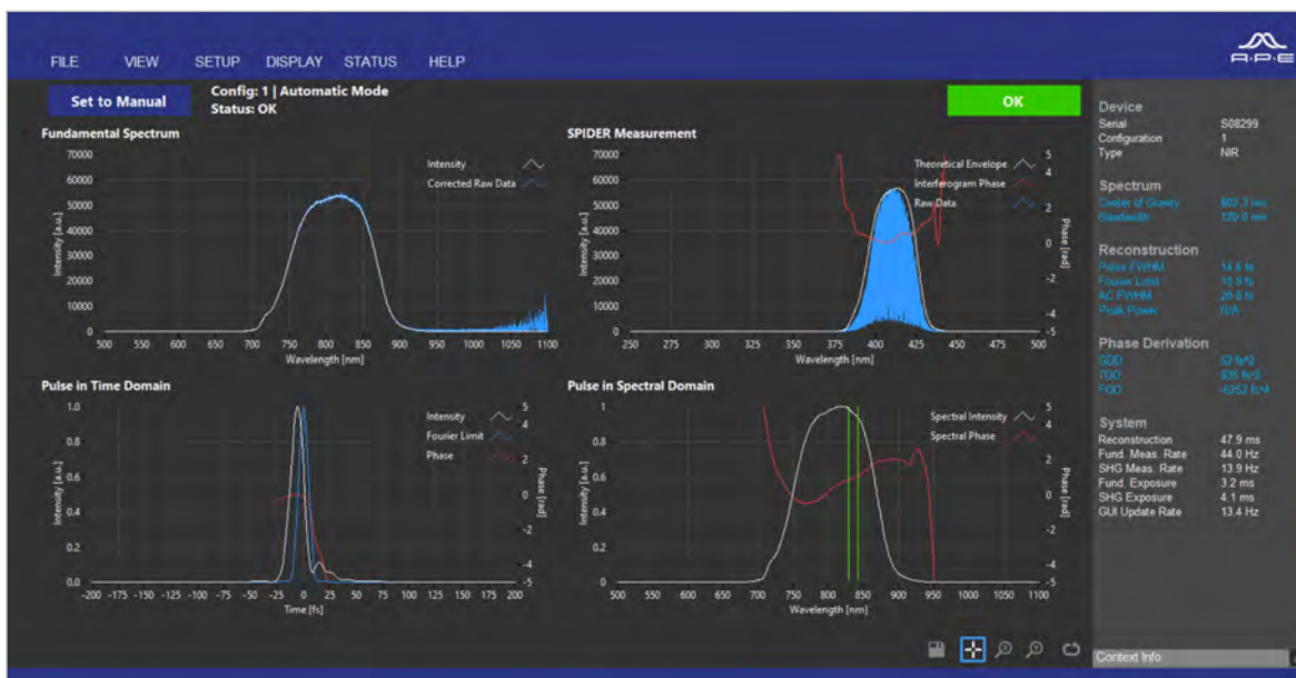
Software Interface FC Spider and Spider

Important software features for advanced pulse characterization are provided with all APE Spiders. If desired, a PC or notebook with pre-installed software will be delivered together with the instrument.