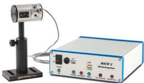
MACH 6 (Rear View)