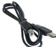
USB Cable (Model Number: 202373)