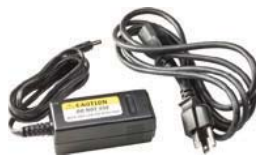
Additional 9V Power Supply (Model Number: 200960)