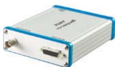
APM Analog Power Supply (Model Number: 201848) See page 57 for specs.