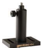
Stand with Delrin Post (Model Number: 200428)