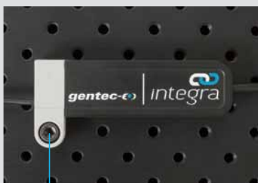
Secure it on your Optical Table

Watch the Introduction video available on our website at www.gentec-eo.com