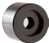
PE3B-Si (3 mm - UV-Silicon)