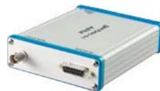
APM Analog Power Supply (Model Number: 201848)