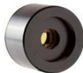
PE5B-Ge (5 mm - Germanium)