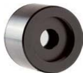
PE10B-Si (10 mm - UV-Silicon)