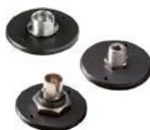
Fiber Adaptors & Connectors (FC, ST or SMA)