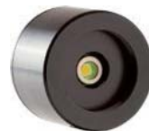
PE3B-In (3 mm - InGaAs)