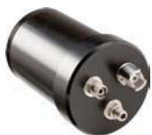
3-Port Fiber Cylinder with Adaptors and Plug