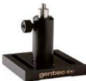
Stand with Steel Post (Model Number: 200234)