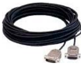
Extension Cables (4, 15, 20 or 25 m)