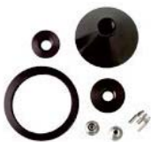
Fiber Adaptors and Connectors (FC, SC or SMA)