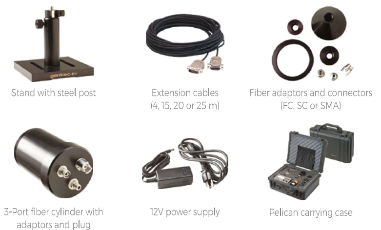
Stand with steel post