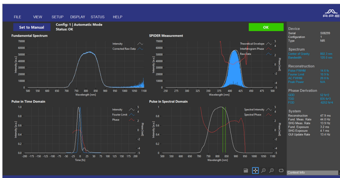
Software Interface FC Spider and Spider

Important software features for advanced pulse characterization are provided with all APE Spiders. If desired, a PC or notebook with pre-installed software can optionally be delivered together with the instrument.